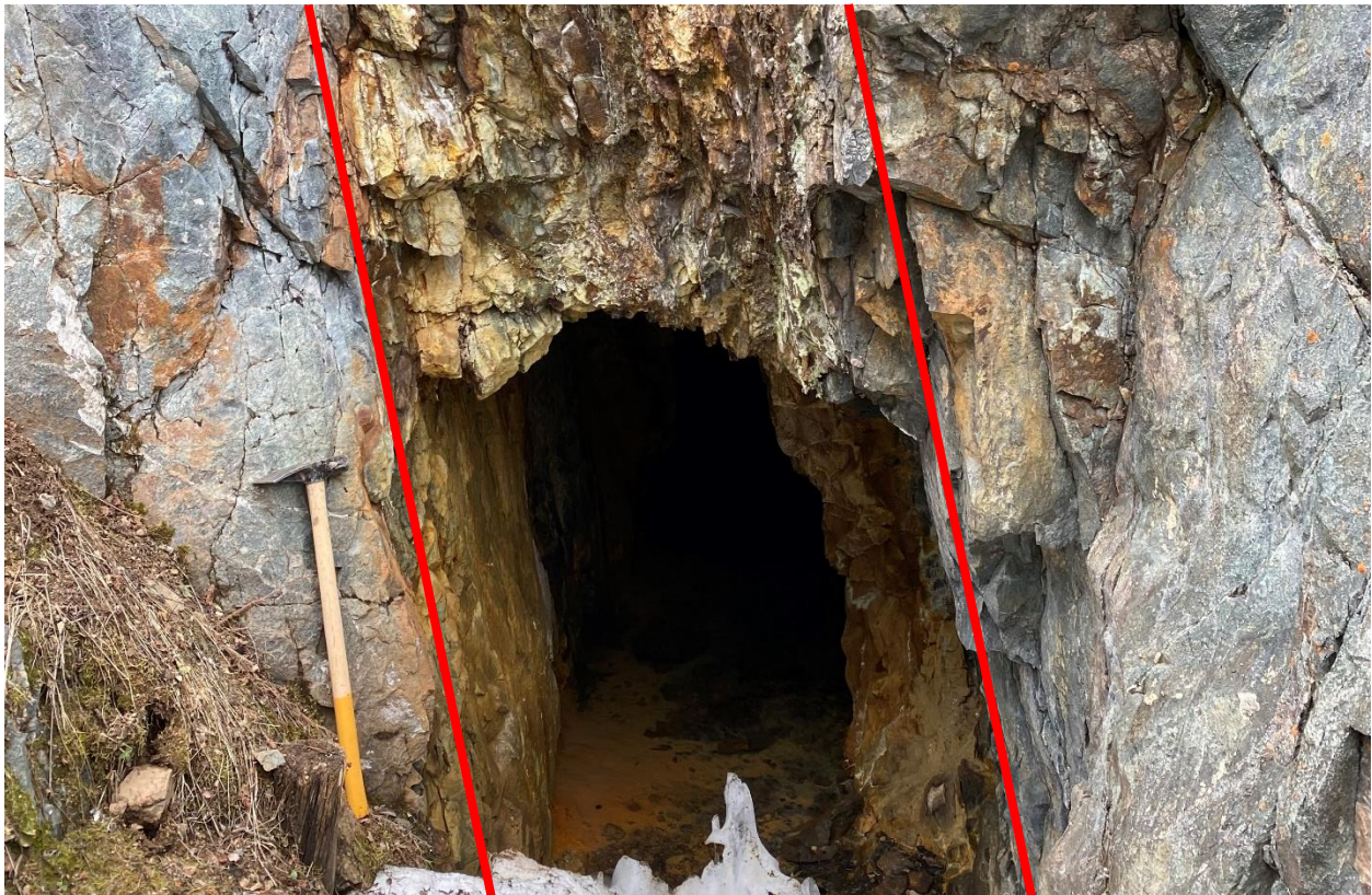
Figure 1: Historic gold-copper mine located within the south central LMSL project area on the southwestern edge of the Lucky Mike area. Chalcopyrite and pyrite were visibly identified related to quartz veins within a broken and fault gouged zone cutting intensely silicified volcanic rocks.

The initial work program has identified the location of an early 1900s era gold-copper mine previously incorrectly plotted in the BC government database (see figure 2) and represents one of many historic workings located on the LMSL Property. The historic mine adit was located while infilling an area with limited data surrounded by anomalous copper geochemistry, identified by the Company’s extensive compilation program as a high priority area. Historic mining in this area was thought to have taken place during the early 1910s, however there are no records of development and no evidence of drilling.