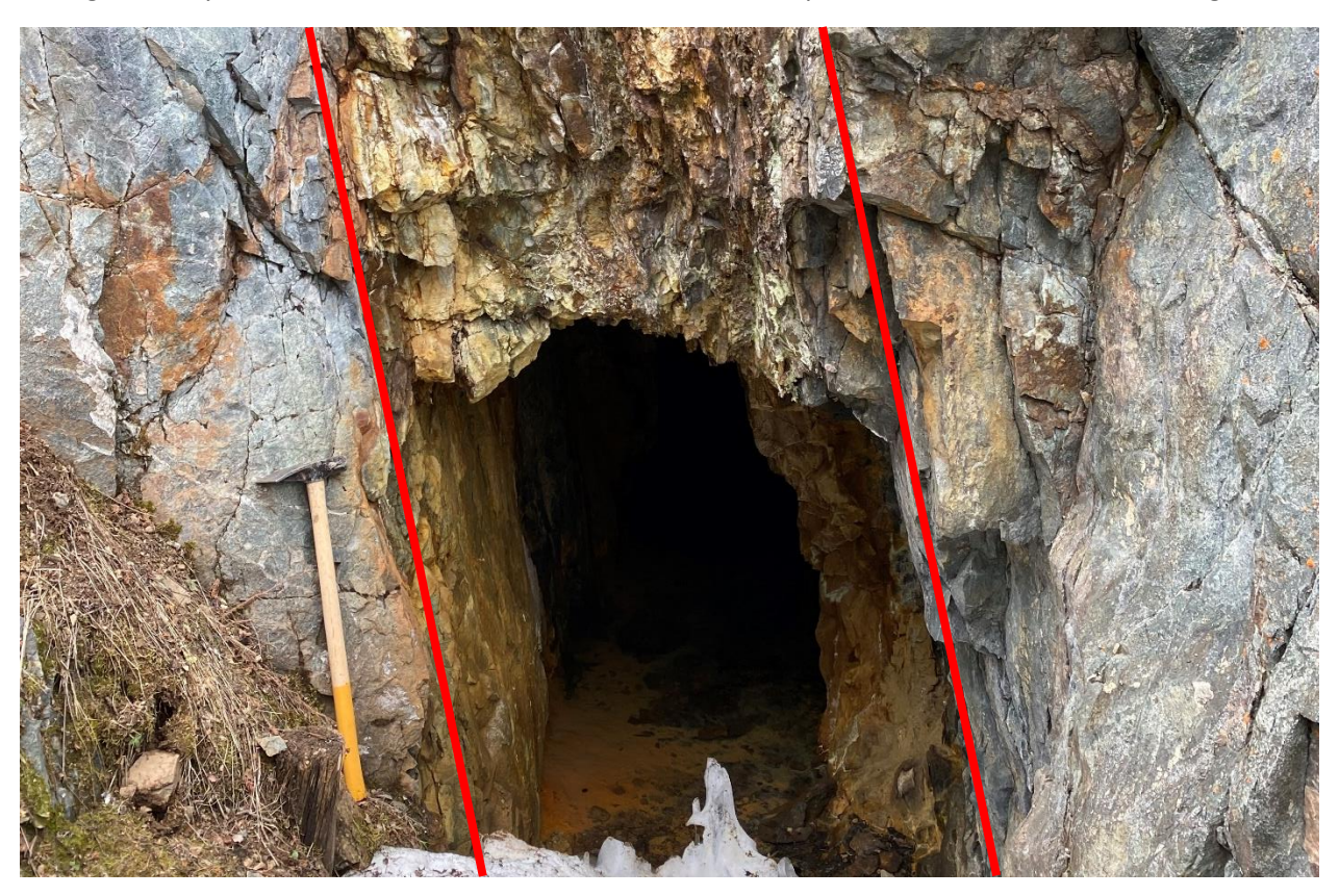
Figure 1: Historic gold-copper mine located within the south central LMSL project area on the southwestern edge of the Lucky Mike area. Chalcopyrite and pyrite were visibly identified related to quartz veins within a broken and fault gouged zone cutting intensely silicified volcanic rocks.

The initial work program has identified the location of an early 1900s era gold-copper mine previously incorrectly plotted in the BC government database (see figure 2) and represents one of many historic workings located on the LMSL Property. The historic mine adit was located while infilling an area with limited data surrounded by anomalous copper geochemistry, identified by the Company's extensive compilation program as a high priority area. Historic mining in this area was thought to have taken place during the early 1910s, however there are no records of development and no evidence of drilling.