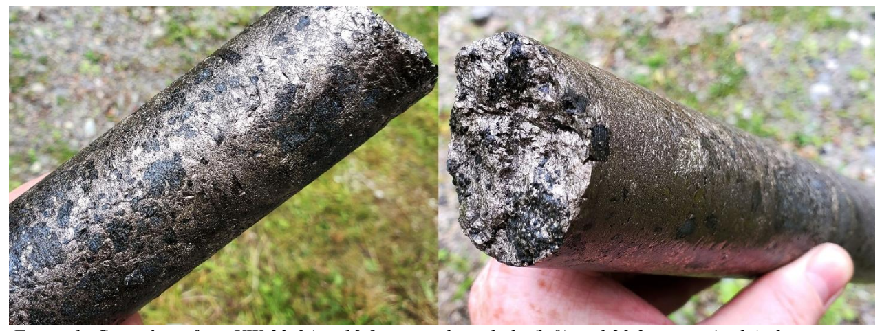
Figure 1: Core photo from VW-23-04 at 19.8 metres down hole (left) and 20.2 metres (right) showing nettexture, sulfide-matrix to massive texture.

Adrian Smith, CEO of the Company commented, "These new holes show the highest concentration of sulphides on the property that we have seen. We are also seeing a variation of metals with a greater amount of visible copper higher in the system and greater concentrations of sulfides below, leaving us excited to follow the mineralization to depth where more massive sulfides could exist. The latest drilling verifies the presence of favorable conditions for the development of substantial mineral accumulations, and we are enthusiastic about progressing with our efforts at Voisey's West."