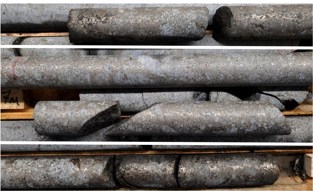
Figure 2: Drill hole VW-23-04 drill core showing net texture and sulfide-matrix breccia textures from 14 to 14.5 (top) from 20.5 to 21.5 (middle) and from 19.5 to 20 (bottom).

The Company's Geologists confirm a magmatic sulfide system is hosted on the Voisey's West, similar to the nearby Voisey's Bay mine. Typical magmatic sulfide textures from the current drilling are shown in Figures 1 to 4 below and include type examples of net-texture, semi-massive and sulfide-matrix breccia textures. These are formed as mafic intrusions interact with sulfurous country rock and separate the metals from the magma during emplacement. The sulfurous country rocks at Voisey's West are the same metamorphosed sediments (paragneiss) as at Voisey's Bay which have proven themselves to be an ideal source of sulfur to generate large volumes of sulfides. The depth potential of the system is only constrained by the presence of the sulfur-bearing country rocks, which in the case of Voisey's West appears to be significant.