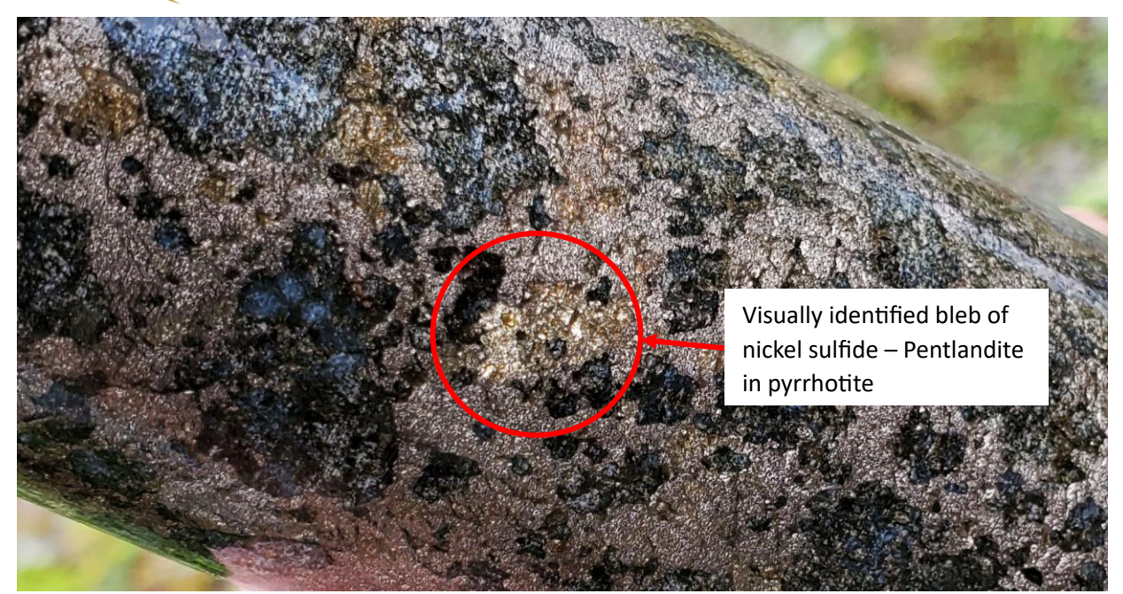
Figure 3: Close up of core from hole VW-23-04 at 14 metres down hole showing bleb of visually identified nickel sulfide (pentlandite) within sulfide-matrix breccia.