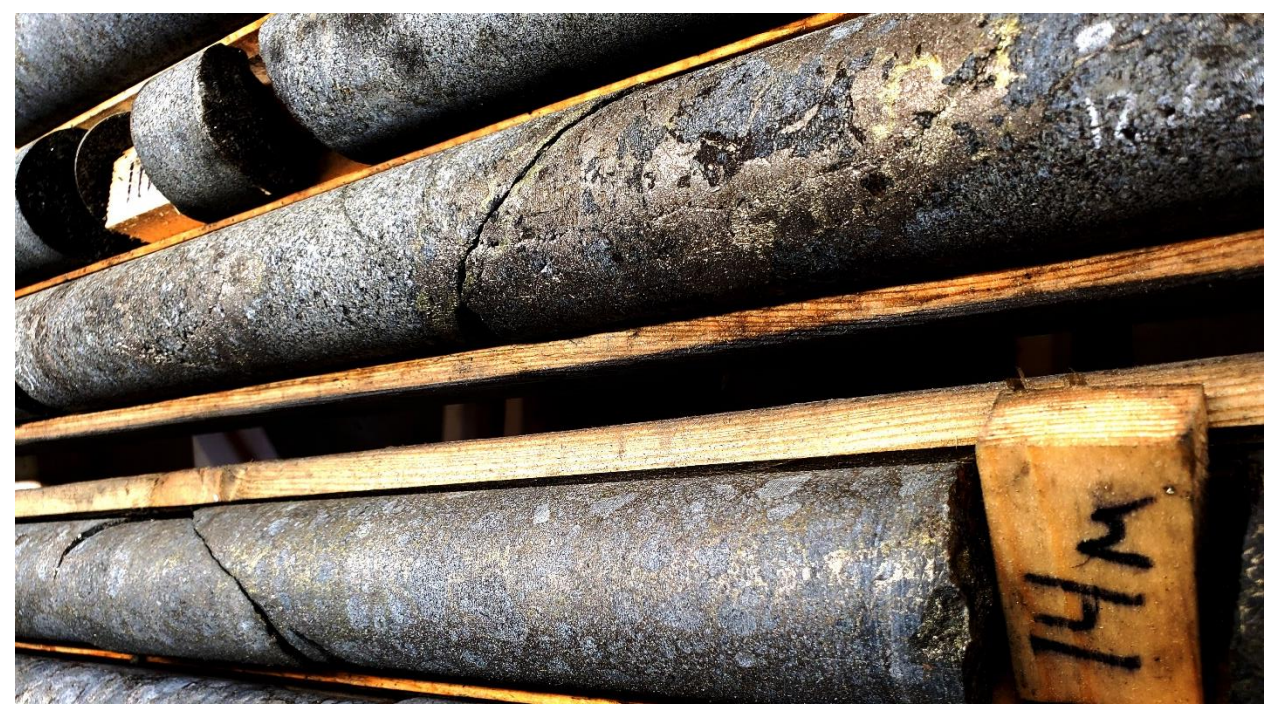
Figure 4: Hole VW-23-05 from 12 and 14 metres downhole showing net-textured and blebby massive sulphides with higher concentration of visible copper (chalcopyrite) with visually identified nickel sulfide and pyrrhotite.

Drill hole VW-23-05 cut additional visible sulfides at the newly discovered North Baccy Zone over a 16-metre interval. The sulfides are concentrated in the same gabbroic intrusive rock but show higher elevations of visible copper mineralization as seen in Figure 4. Sulfide concentrations range from 2% to predominantly